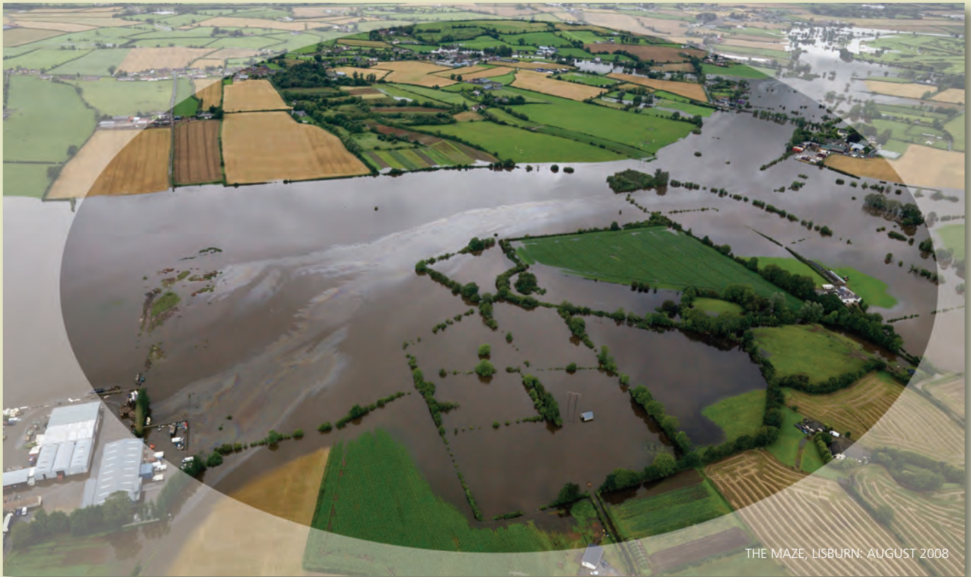
Aerial Photograph of the River Lagan Flood Plain (for illustration purposes only)